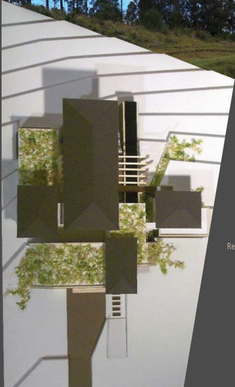
Repetitive dominant roof forms creates rythm