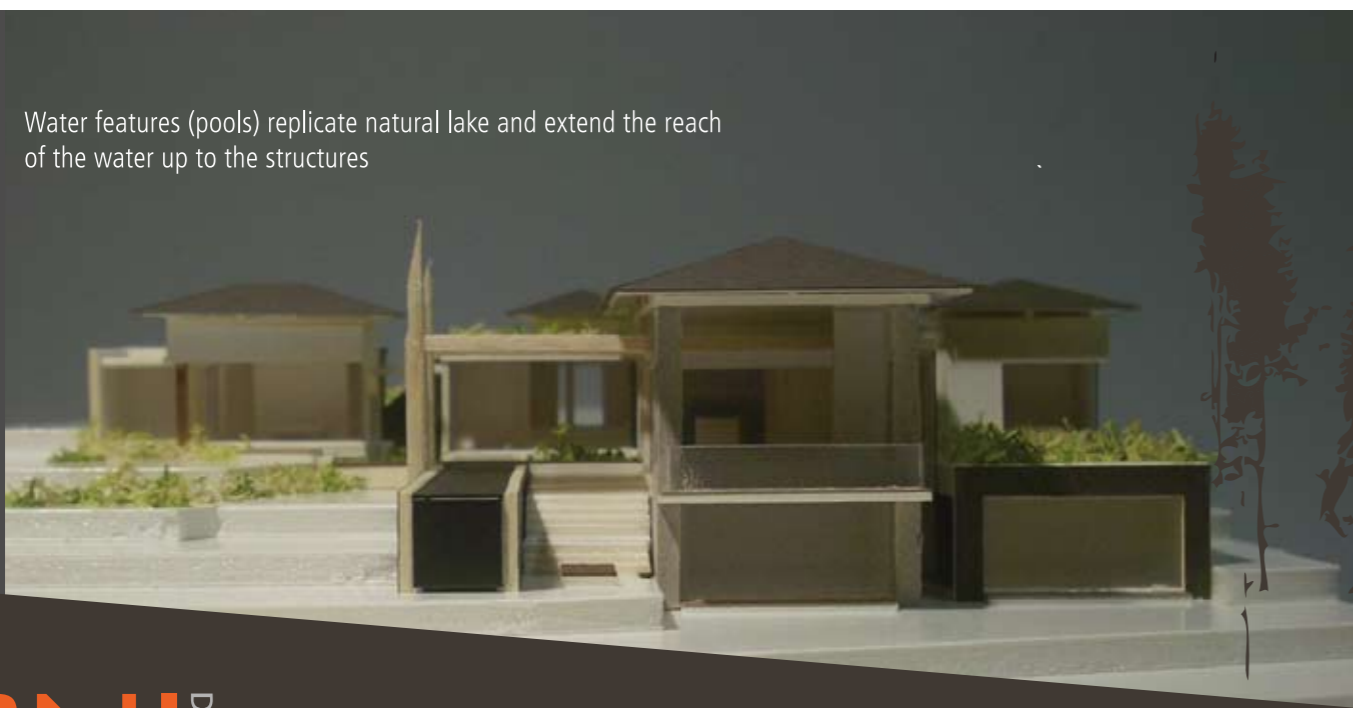
Water features (pools) replicate natural lake and extend the reach of the water up to the structures